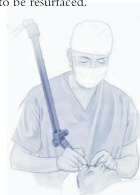
During laser resurfacing, the surgeon's aim is to remove all of the epidermis and the top part of the dermis using precision, high-energy laser light.

Usually about 30 - 90 minutes, depending upon the areas to be resurfaced.